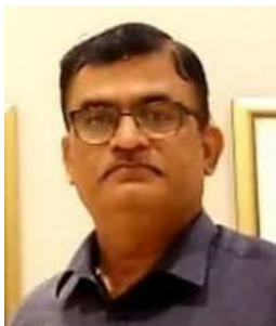
Shri. Anand Sharma